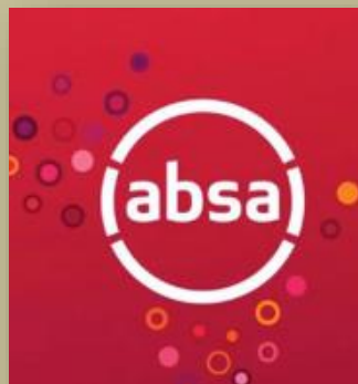
Administrative : Absa Trust