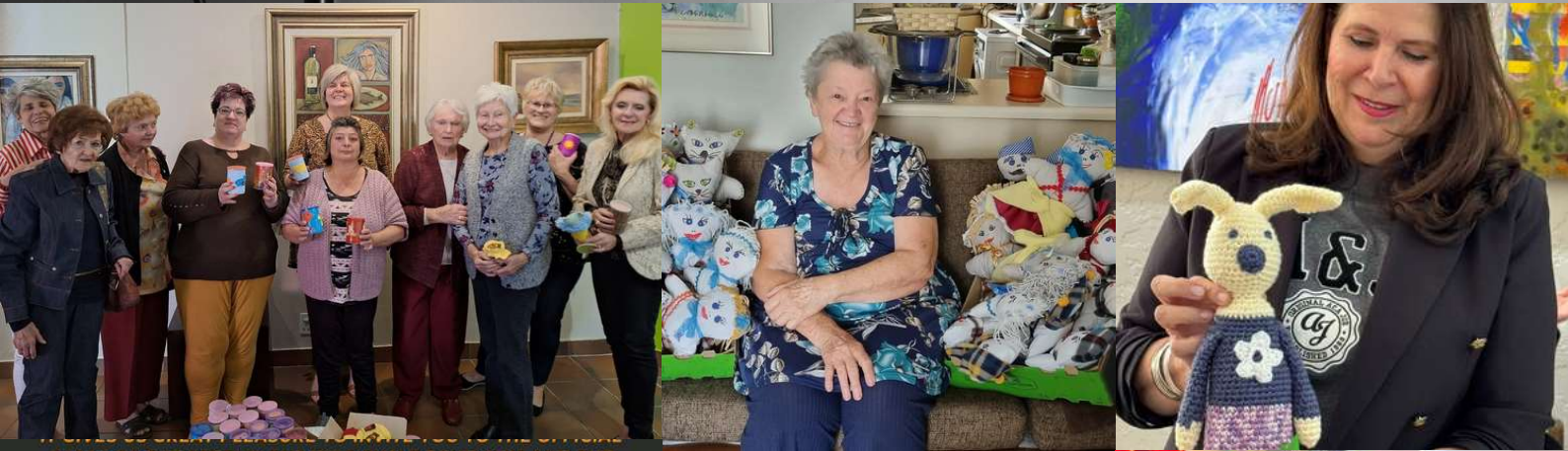
START OF THE XTREME FOR KIDS CYCLE TOUR 2025 AND THE MATLA A BANA NATIONAL SCHOOL TOUR.